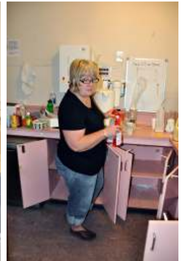
Packing above and moving in below